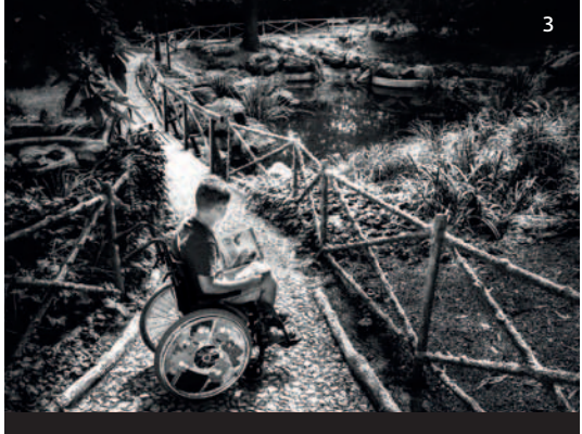
He will never get on his feet!